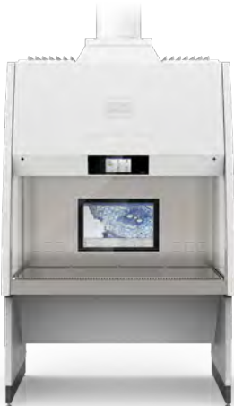
Claire® total T-130 Article No. 203000