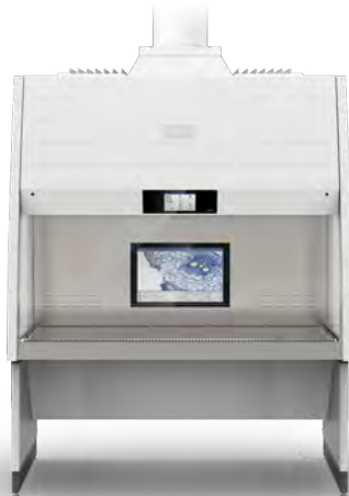
Claire® total T-160 Article No. 203001