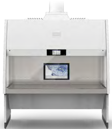
Claire® total T-190 Article No. 203002